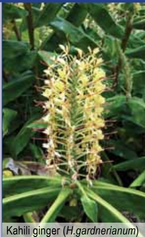
Kahili ginger ( H. gardnerianum )

( Hedychium flavescens , H. gardnerianum )