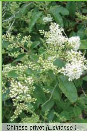
Chinese privet ( L. sinense )

Evergreen trees growing to 10 metres (tree privet - shown here in berry) and 7 metres (Chinese privet - shown in flower). Tree privet has dark green glossy leaves while Chinese privet has small, dull green leaves with wavy edges. Both species have spikes of white flowers and black, bird-spread berries. Crowds out native species in natural areas.