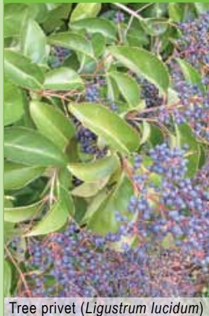
Tree privet ( Ligustrum lucidum )