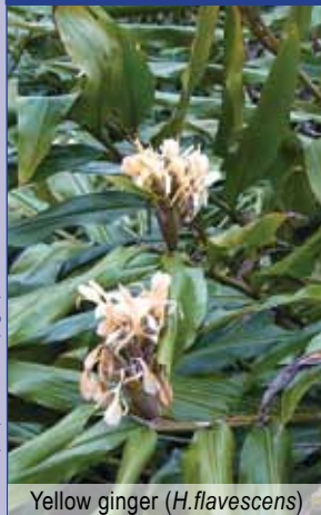
Yellow ginger ( H. flavescens )